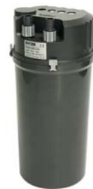
Sacem Marathon external canister filter

Test the water with a Waterlife seawater pH test kit , before adding livestock to your system. This is essential, as the process of maturing the filter may have lowered the pH, as far as 7.7 - 7.9. You can rectify this by using Waterlife's 8.3 Buffer . If you are going to keep invertebrates, test for nitrates and adjust the nitrate level to zero again by partial water changes using R.O. water and Ultramarine sea salt .